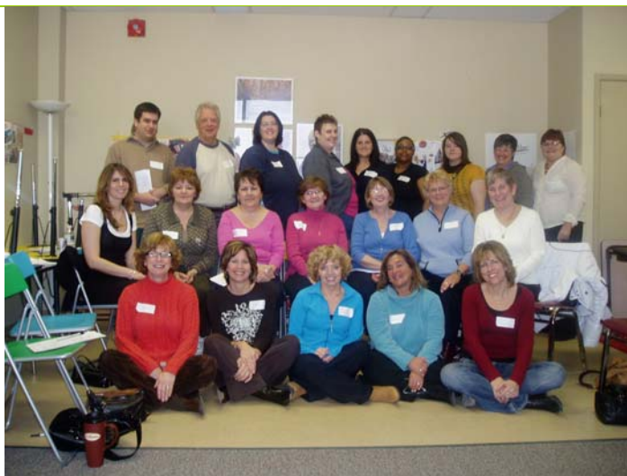
Our facilitators and supervisors pose during our recent "Supporting Our Supporters Day". This refreshing event allowed everyone to network together, discuss recent changes at BFO-HP, meditate and explore expressive art.